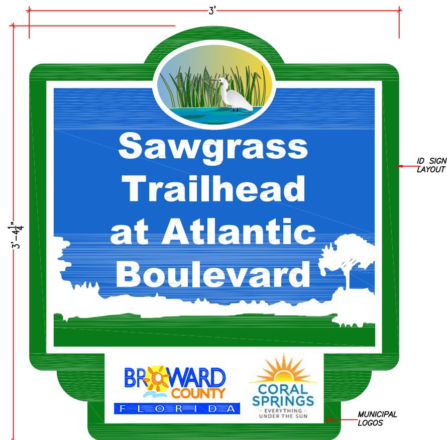
ENTRANCE SIGN LAYOUT DETAIL N.T.S