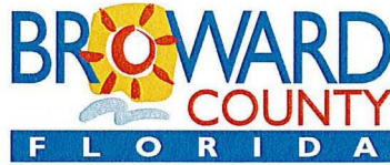
Exhibit 1 OFFICE OF THE COUNTY ATTORNEY 115 S. Andrews Avenue, Suite 423 Fort Lauderdale, Florida 33301