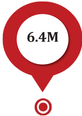
in scholarships awarded

Monthly group mentoring by highly accomplished professional women in partnership with public high schools