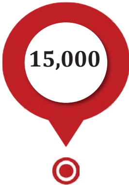
at-risk young women served since inception