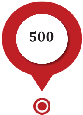
top-level mentors and community leaders