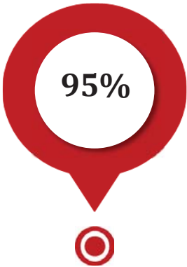
high school graduation rate