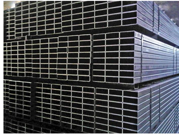
Stainless steel tube