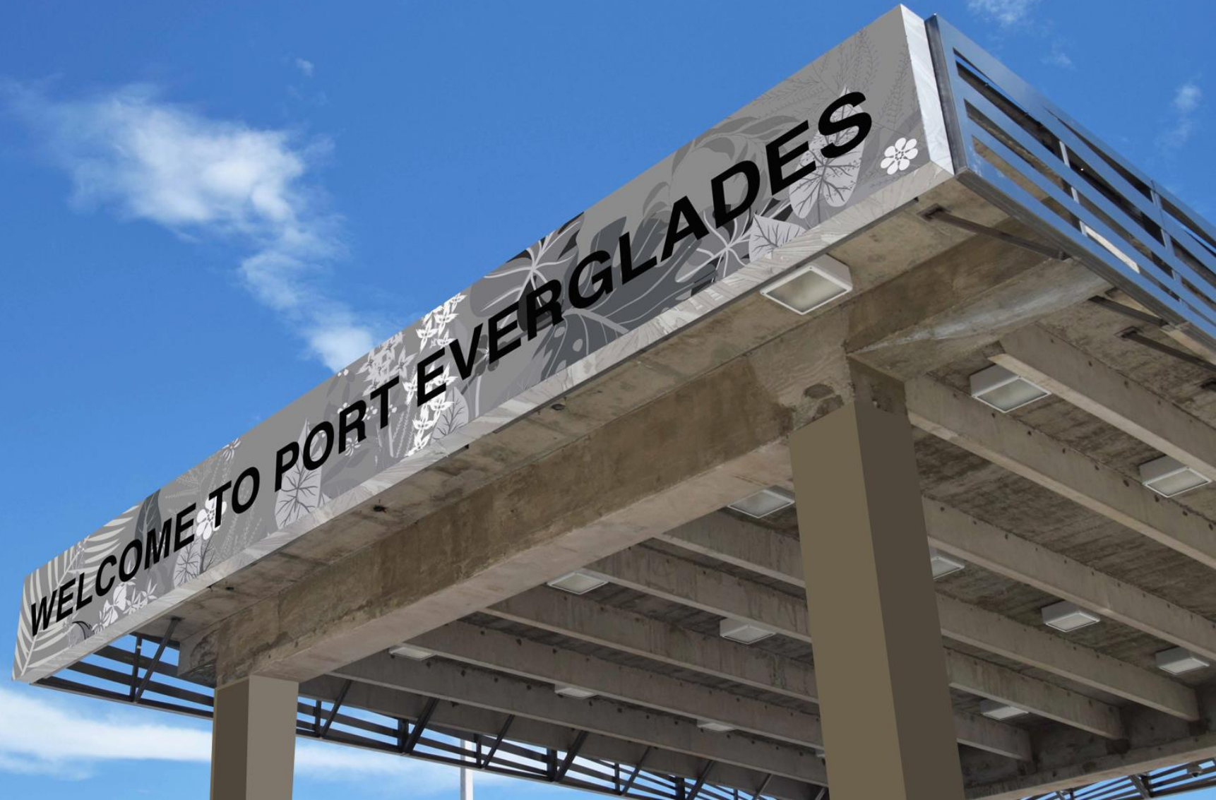
EXHIBIT 2 Page 5 of 8