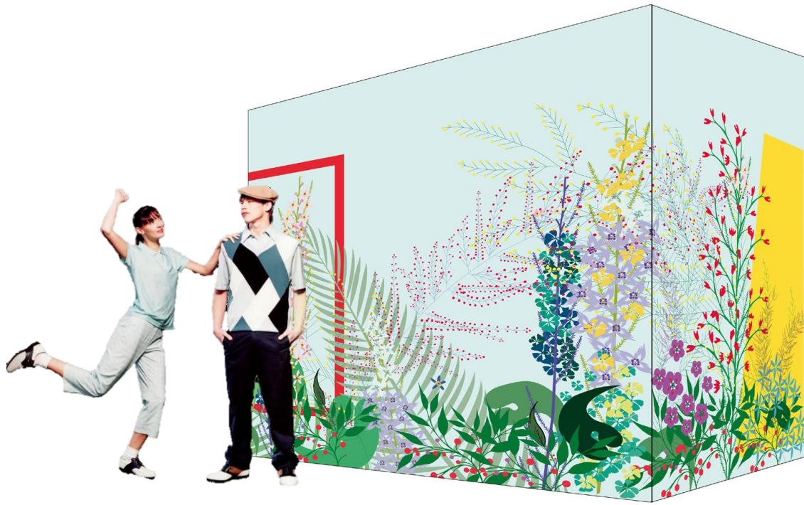
EXHIBIT 2 Page 6 of 8