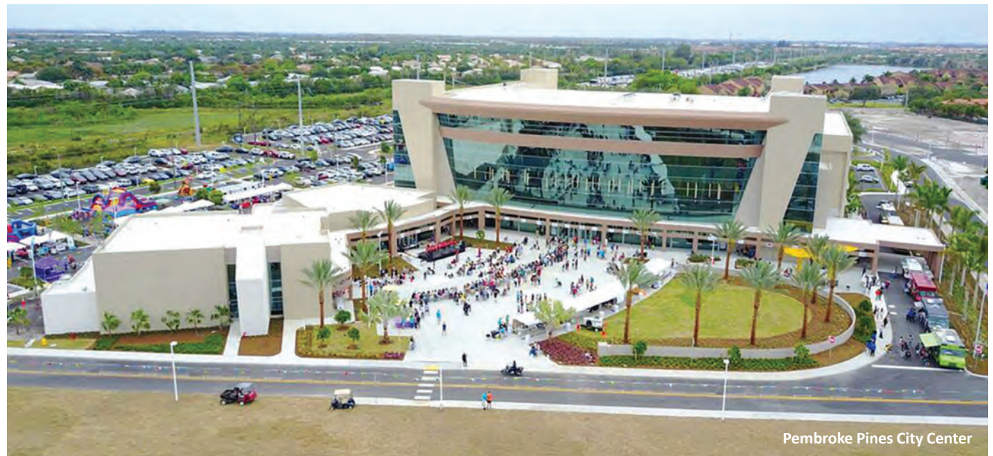
Pembroke Pines City Center

Was hosted by the South Florida Regional Planning Council in Hollywood for an overview of the South Florida Economic Development District , including details of the grant programs and