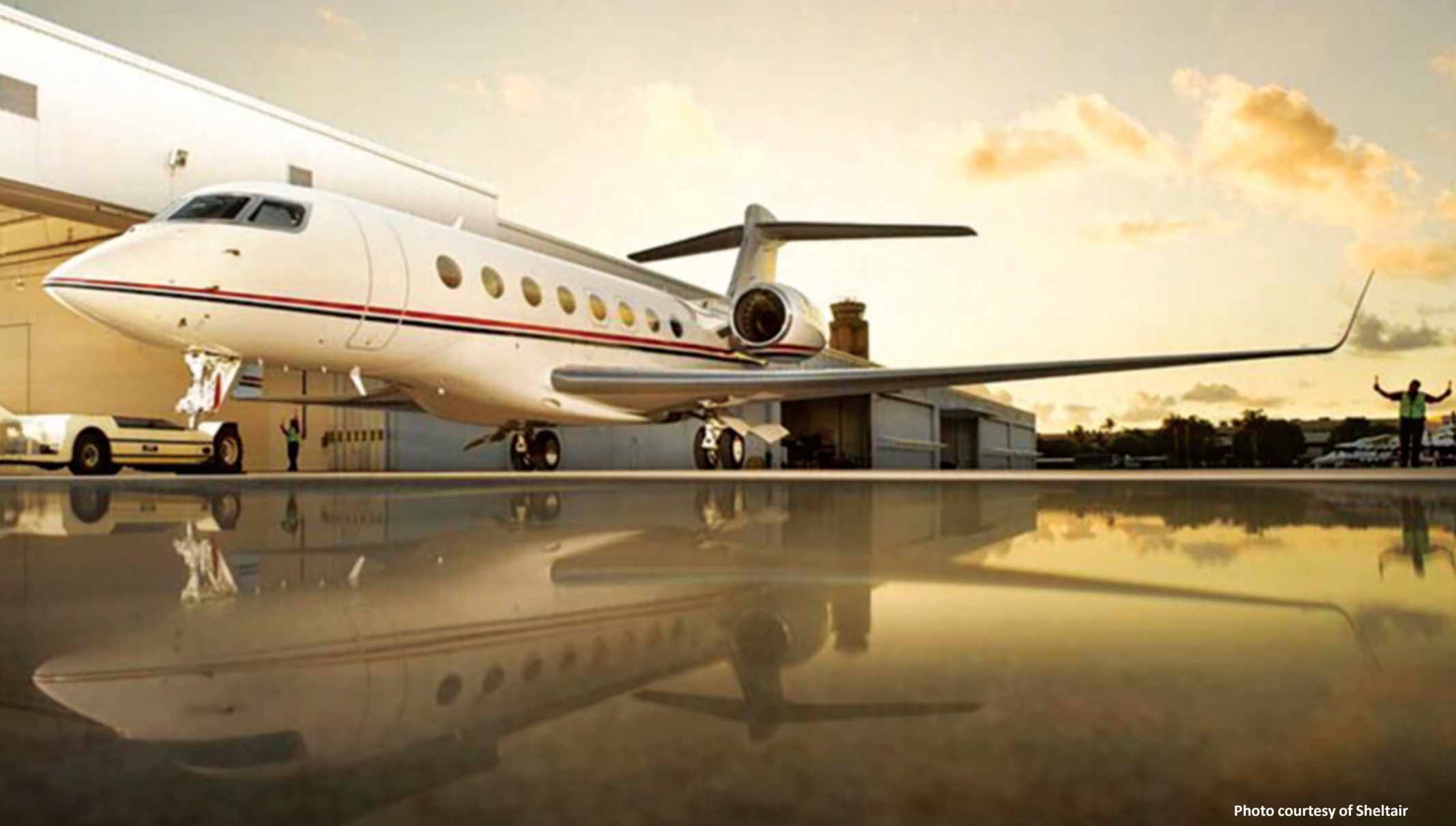
Exhibit 2 Alliance 2016-2017 Annual Report and Activity Summary Page 6 of 32

Following is a summary of the roles and some of the work of each council.