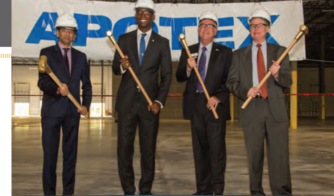
Apotex Pharmaceuticals groundbreaking in Miramar

The Alliance was a sponsor for the 3rd Annual Hedge Fund Symposium held at the Ritz Carlton Fort Lauderdale. This gathering included 100 high net-worth fund managers and investors. This event, held concurrently with the Fort Lauderdale International Boat Show, brings high value fund managers and consultants to Fort Lauderdale.