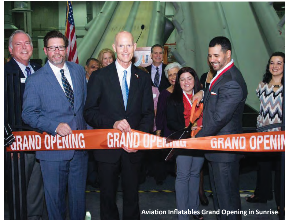
Aviation Inflatables Grand Opening in Sunrise

For the first time, the Alliance was recognized for the Deal of the Year