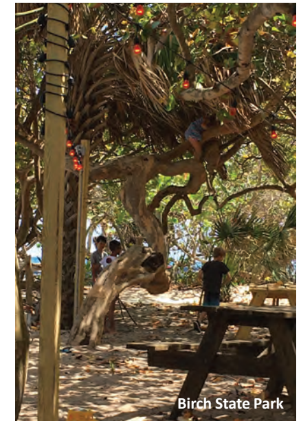
Birch State Park