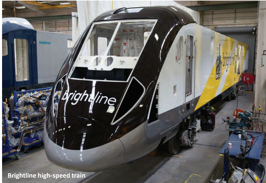
Brightline high-speed train