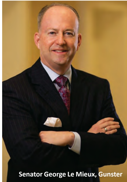
Senator George Le Mieux, Gunster

Act. A press conference was held on December 22 at the port. The project, estimated to cost approximately $370 million, will be paid with revenue generated through port user fees, federal appropriations and state grants. No local property taxes will be used for this project as Port Everglades is a self-funded enterprise zone of Broward County. The project is in the preconstruction engineering and design phase and can now proceed through the permitting and federal funding processes. The project is anticipated to create an estimated 2,200 construction jobs and nearly 1,500 permanent direct jobs locally resulting from additional cargo capacity. Members of the