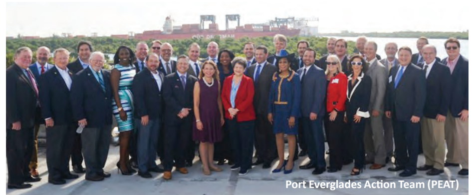
Port Everglades Action Team (PEAT)