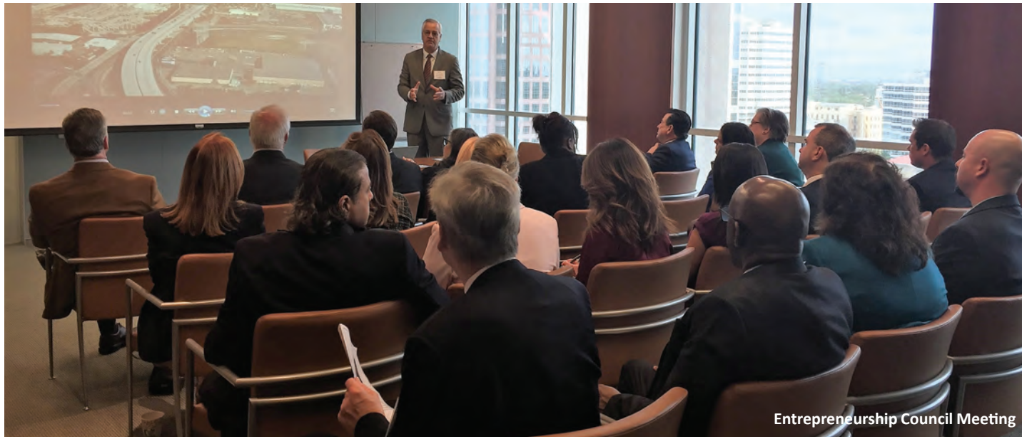
Entrepreneurship Council Meeting