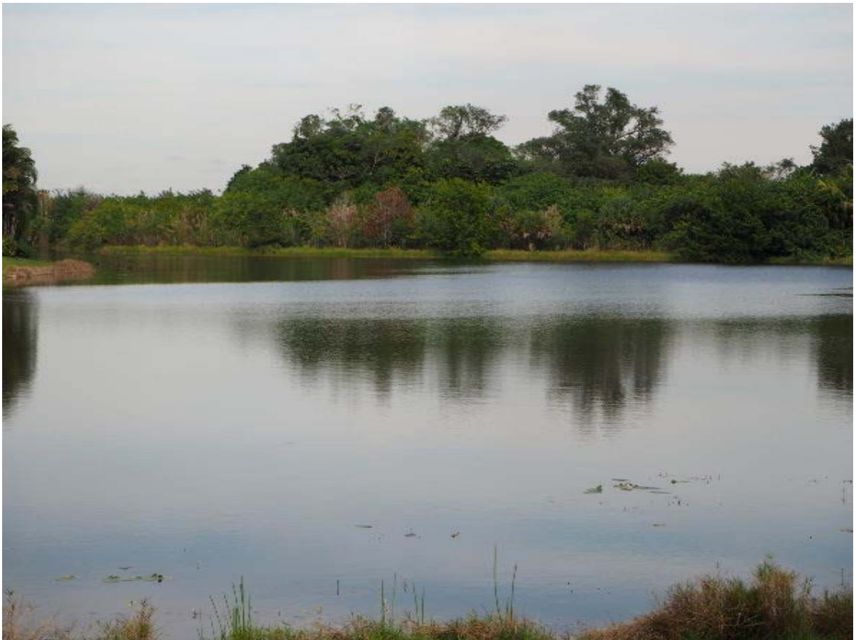
Figure 1. Photo of Buzzards Roost Site, view North across lake from NW 9 th Street. (1.18.2017).