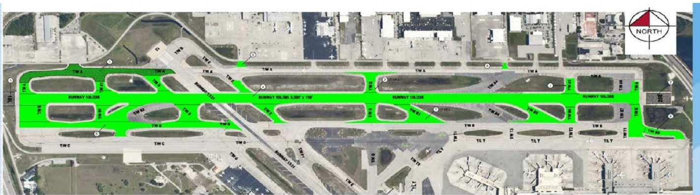
Exhibit 1 – Location and Limits of Work