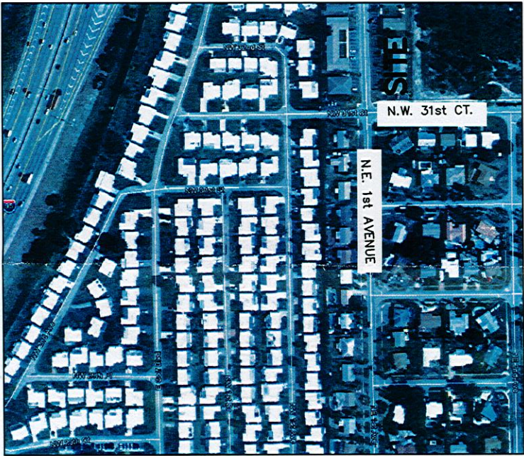
LOCATION SKETCH NOT TO SCALE